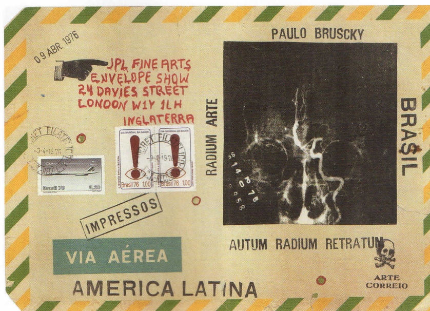
Paulo Bruscky, Mail Art envelope with an X-ray of the artist's face, 1976, approx. 5 x 6½ in. (12.5 x 17.5 cm) (artwork © Paulo Bruscky)

and Marxism, art's meaning and interpretation are increasingly an ongoing, largely "collaborative" process negotiated among multiple readers-viewers-participants and institutions, including those in the cultural industry. The role of the mass media and the art market in imposing the cultural value of an artist is paramount but seldom if ever analyzed or critiqued.