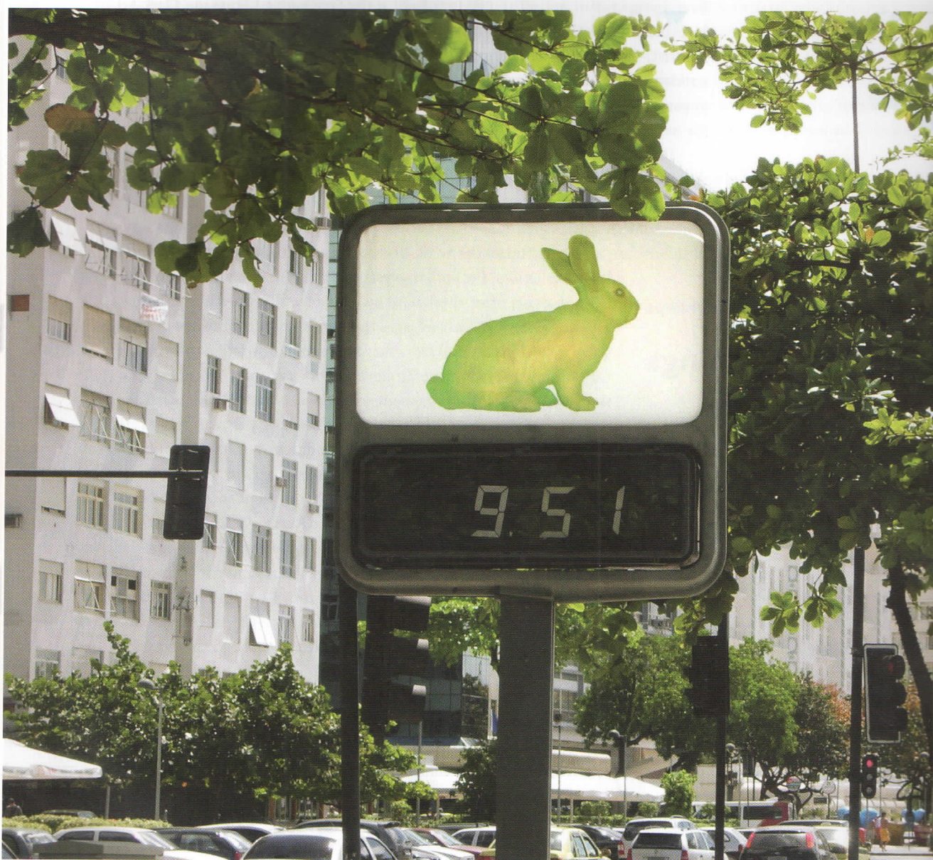
Digital street clock in Copacabana beach with image of Eduardo Kac's 2000 GFP Bunny, a public intervention in Rio de Janeiro as part of his solo show Rabbit Remix at the gallery Laura Marsiaj Arte Contemporânea, Rio de Janeiro, Brazil, 2004 (artwork © Eduardo Kac;)