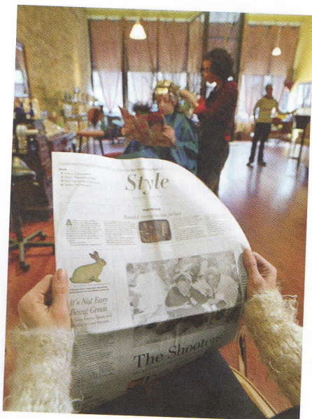
Eduardo Kac, Free Alba! 2001, series of six color photographs mounted on aluminum with Plexiglas, each approx. 36 in. (91.4 cm) in width, edition of 5, shown in the exhibition Rabbit Remix at Laura Marsiaj Arte Contemporânea, Rio de Janeiro, Brazil, 2004 (artwork © Eduardo Kac).

Media coverage of Kac's GFP Bunny included articles in the Washington Post , Folha de São Paulo , Le Monde , Ann Arbor News , Boston Globe , and Die Woche . Kac incorporated the coverage in Free Alba! .