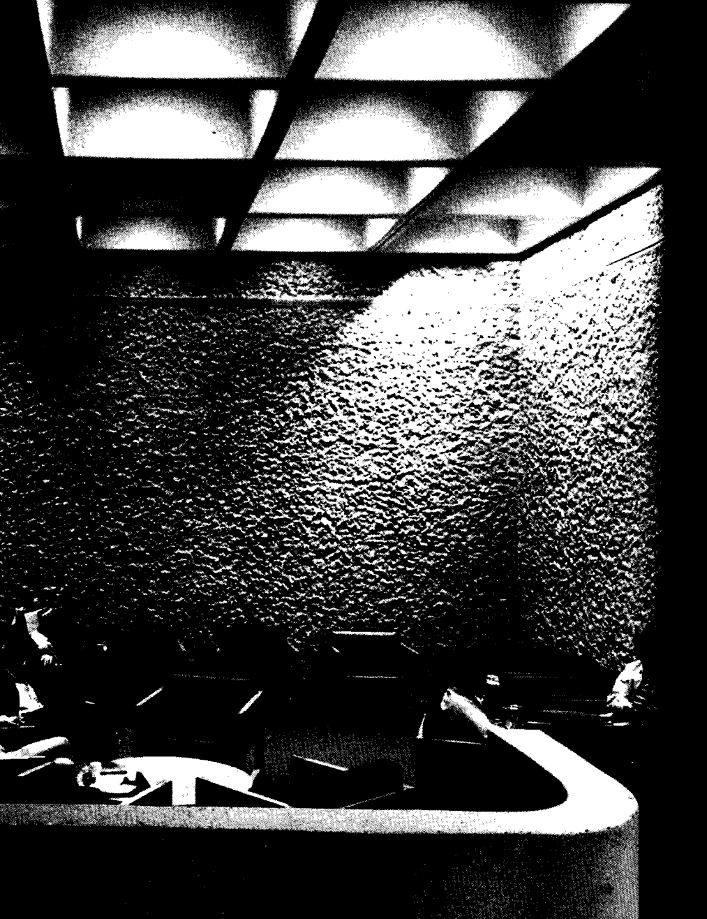
Fig. 57. Student lounge, Ross Building

Fig. 58. York University master plan, site model