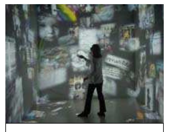
Fig. 5 Christa Sommerer / Laurent Mignonneau: The Living Web, 2002.

competence, which goes beyond mere technical skills, is difficult to acquire if the area of historic media experience is excluded. Media exert a general influence on forms of perceiving space, objects, and time and they are tied inextricably to humankind's evolution of sense faculties. For how people see and what they see are not simple physiological questions; they are complex cultural processes, which are influenced by many and various social and media-technological innovations. These processes have developed specific characteristics within different cultures and it is possible to decipher these step by step in the legacy left by historical media and literature concerned with visualization, including from the fields of medicine and optics. Not least, in this way light can be shed on the genesis of new media, which are frequently encountered for the first time in works of art as utopian or visionary models.