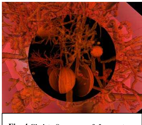
Fig. 4 Christa Sommerer & Laurent Mignonneau : Anthroposcope 1993.

For the interests of media art it is of importance that we continue to take media art history into the mainstream of art history and that we cultivate a proximity to film- cultural and media