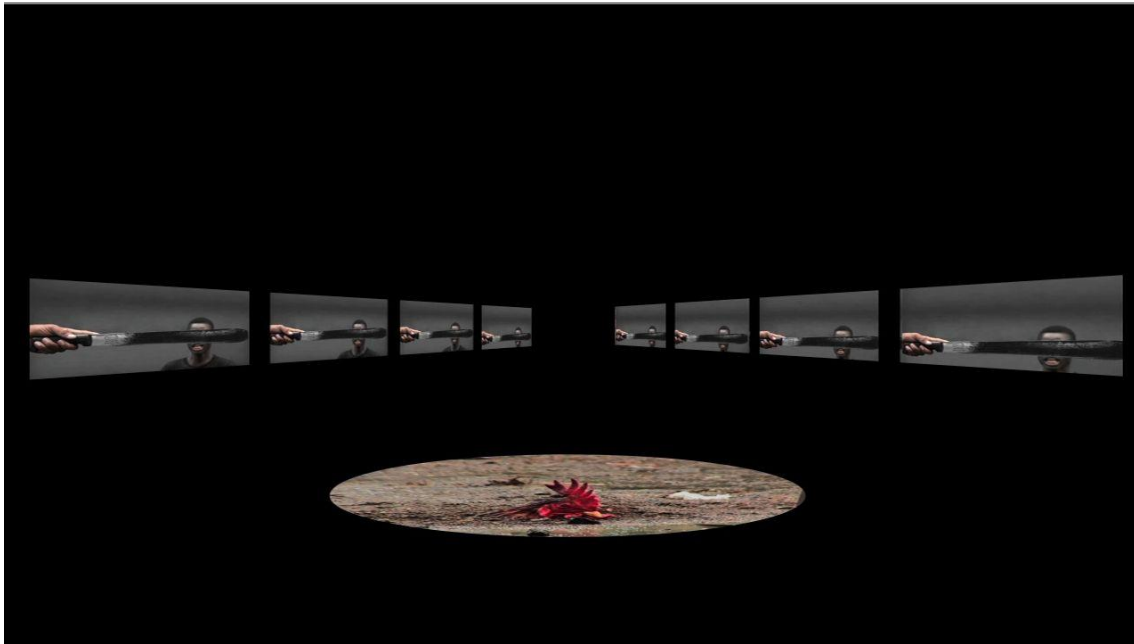
"Heritage Games".

"Heritage Games" was presented as a work in progress in the "IX Festival de la Imagen", Manizales, Colombia (2010) organized by Colombian National University of Caldas. It is programmed to be exhibited in Galería Alonso Garcés. Bogotá on April -March 2011