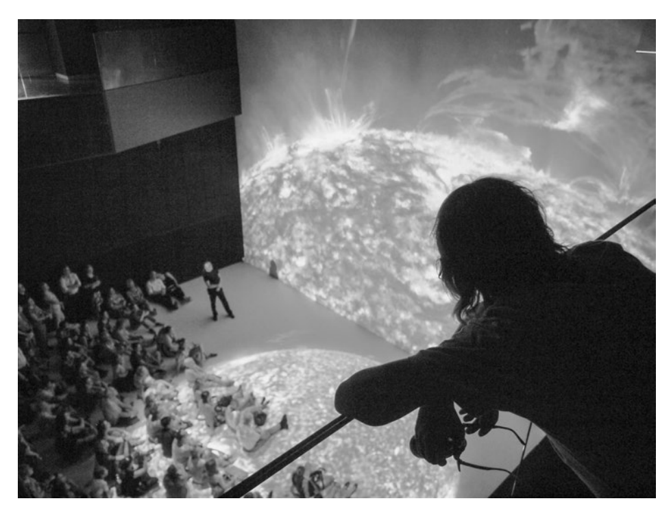
2 Ars Electronica Center - Deep Space 8K. Photo showing an impression of "Sun".

in their interpretive techniques. The ability to accommodate either linear and non-linear narratives or thinking is a particular strength of digital technology that accommodates new structures in the museum and archive landscape. Interactive digital engagement allows even for the audience to engage at a level of critical discussion. Thus, there is a demand for special conditions of the preservation of masterworks both of digital works as well as digitized works. The multifarious manifestations of cultural heritage in the digital age necessitate new methods for the museum and archive to insure inclusion, preservation and understanding (fig. 2).